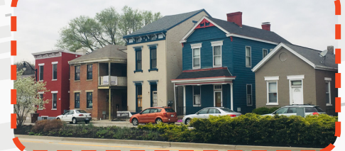
Proposed: Hellmann Plaza