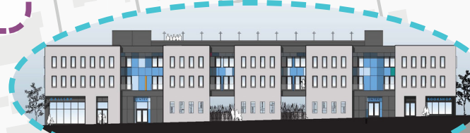
Proposed: Holman Place

302 MLK Blvd Restaurant development underway