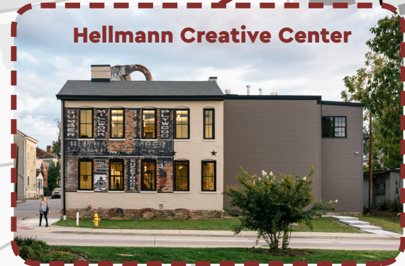
Hellmann Creative Center