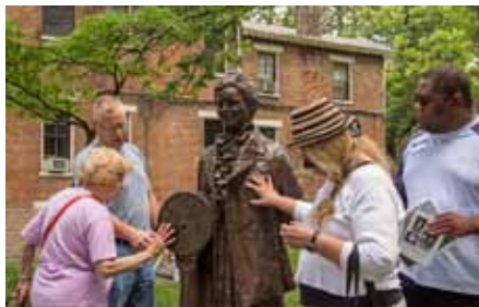
Nano Grant Project Artwalk for the Visually Impaired