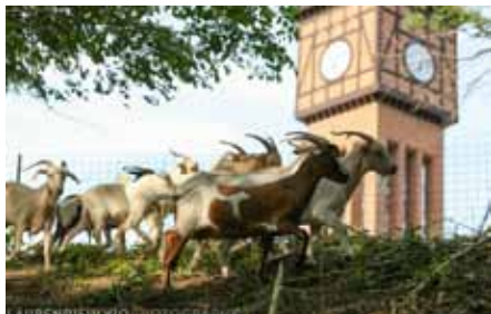
Creative Community Grant Project Goebel Goats

28 projects in 2015, 2483 participants including 701 youth and 91 artists